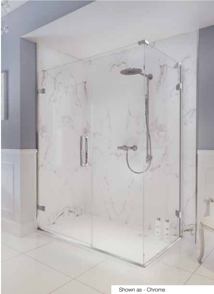
Shown as - Chrome