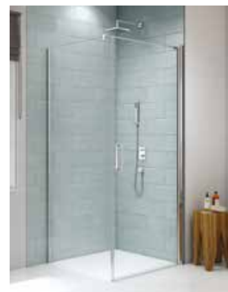
Shown with a Side Panel

For wetroom installation, please reduce Side Panel Tray Finish Adjustment by 10mm.