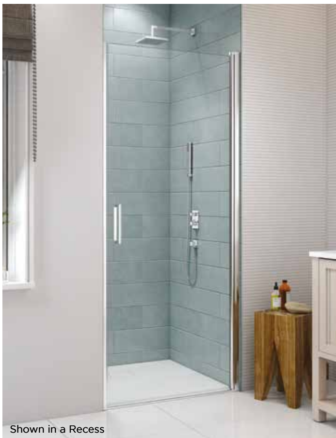
Shown in a Recess