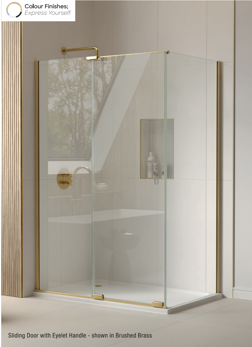
Sliding Door with Eyelet Handle - shown in Brushed Brass